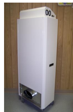
AeroMed® AM-700P configured for exhaust